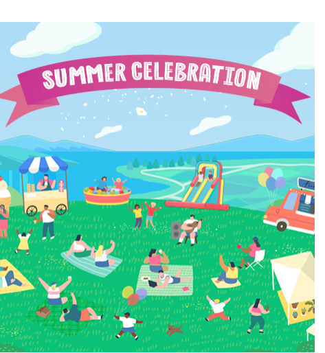
Thursday, June 12 3 p.m. – 6 p.m. Searchlight Library