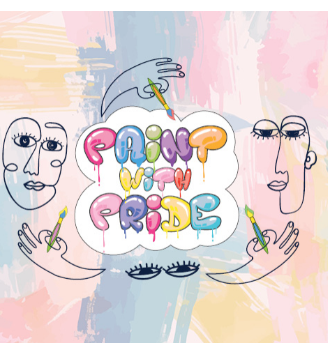
Saturday, June 14 10 a.m.