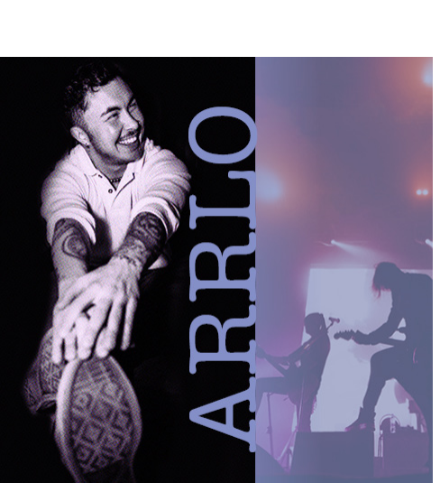
Thursday, June 12 7 p.m.