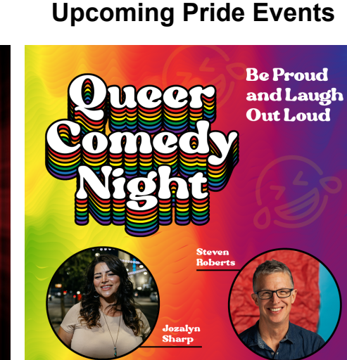
Friday, June 13 7 p.m.