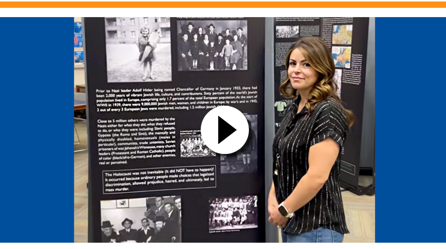
Remember, Reflect & Learn: Traveling Display Explores the Holocaust The Nevada Center for Humanity brings the exhibition "Introduction to the Holocaust: How Did It Happen?" to four library branches this summer. This 12-panel display shares moving survivor stories, rare artifacts, and historic photographs. Visit the exhibit at: Centennial Hills Library, now through June 8; Mesquite Library, June 9 – 22; Clark County Library, June 23 – July 6; and Rainbow Library, July 7 – August 23.