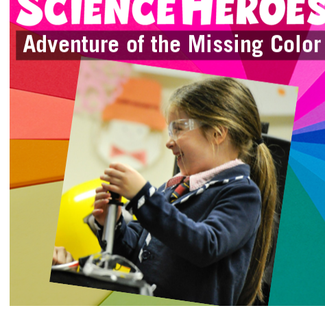
June 9 - 14 Various Times & Locations