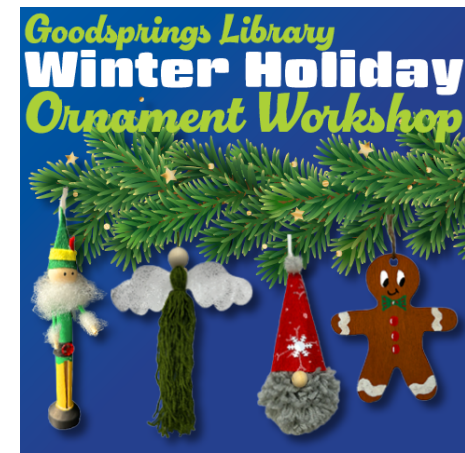
Saturday, November 23 10 a.m. Goodsprings Library