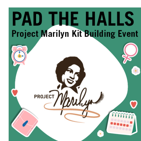
Monday, December 2 4 p.m. Spring Valley Library