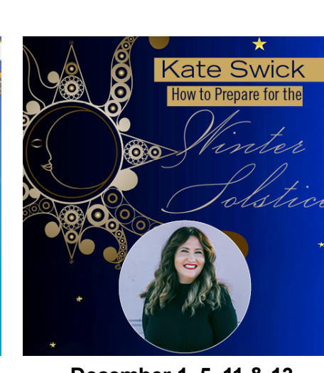
December 1, 5, 11 & 13 Various Times & Locations