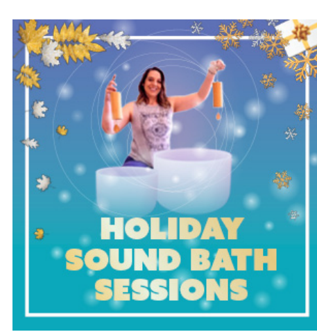
Mondays, November 1 -December 16 11 a.m. West Charleston Library