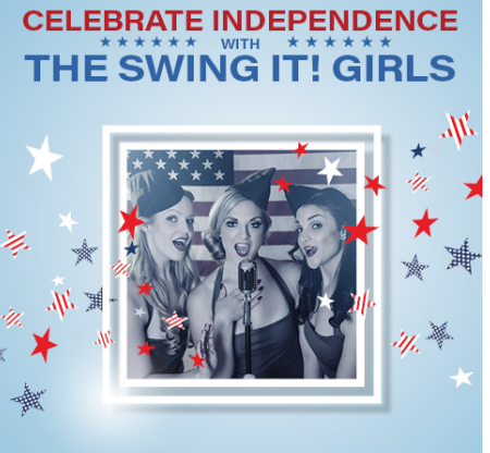
Tuesday, July 2 7 p.m. West Charleston Library