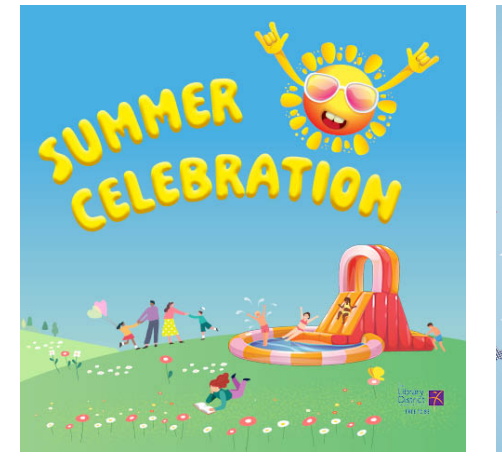
Saturday, June 29 2 p.m. – 6 p.m. Searchlight Town Park

June 28 – 29 Various Times <u>& Locations</u>