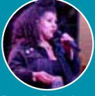
Poetry Promise Poetry workshop May & July