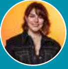
Blue Day Photography demo June