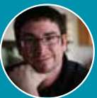
Daniel Clark Photography demo May, June, July