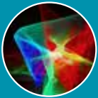
Prismatic Magic Laser light show June

Scan to find your nearest library branch or call 702.734.7323.