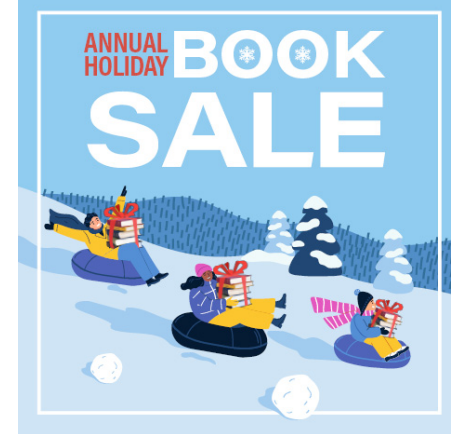
November 30 – December 1 10 a.m. Sahara West Library

Hilton GRAND VACATIONS VALUE AND VACATIONS