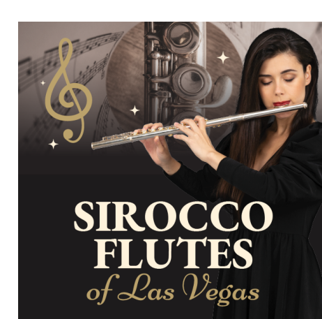
Sunday, November 26 2 p.m. Windmill Library

Seating in our venues is on a first-come, first-served basis and may be limited. Please visit our website for the most updated program information.