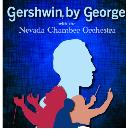
Sunday, September 10 3 p.m. Summerlin Library

Seating in our venues is on a first-come, first-served basis and may be limited. Please visit our website for the most updated program information.