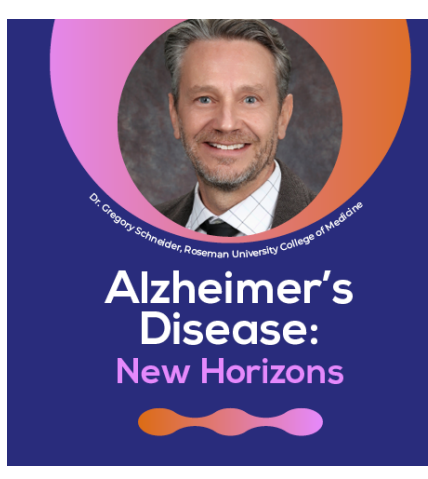
Monday, September 25 11 a.m. <u>Windmill Library</u>