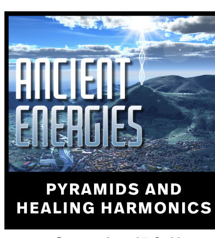
September 17 & 19 <u>Multiple Locations</u> <u>and Times</u>