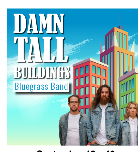
September 18 – 19 7 p.m. Multiple Locations