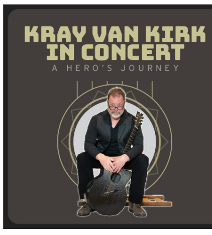
Wednesday, April 26 Multiple Locations & Times