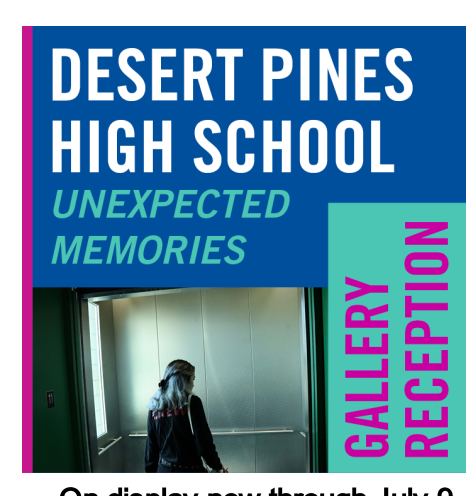
On display now through July 9 East Las Vegas Library

Seating in our venues is on a first-come, first-served basis and may be limited. Please visit our website for the most updated program information.