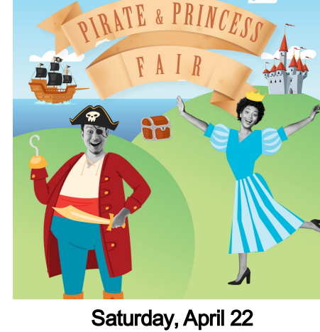
11 a.m. Moapa Valley Library