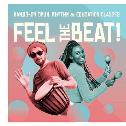
Sunday, April 23 2 p.m. West Charleston Library