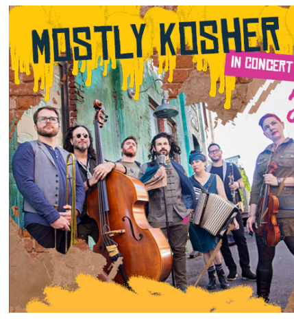
Thursday, April 27 7 p.m. Whitney Library