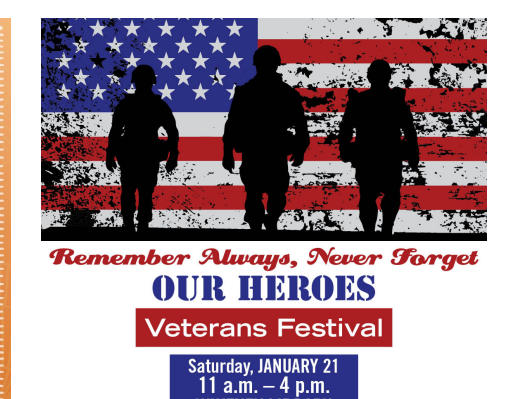
Saturday, January 21 11 a.m. Whitney Library