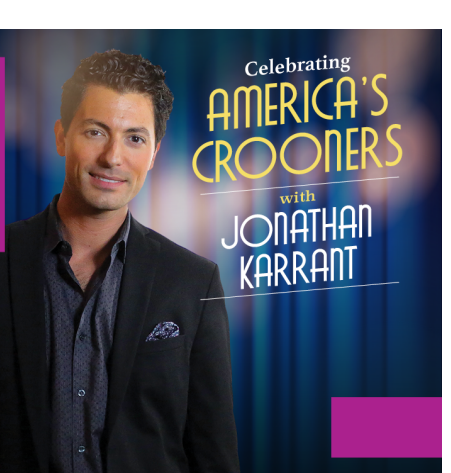
Saturday, January 28 7 p.m. West Charleston Library