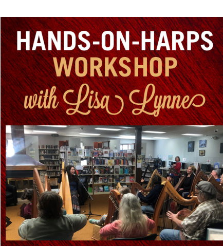
January 25, 27, 28 & 29 Various locations & times