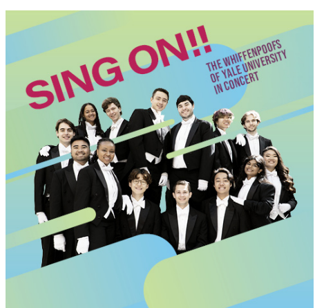
January 21 – 23 Various locations & times