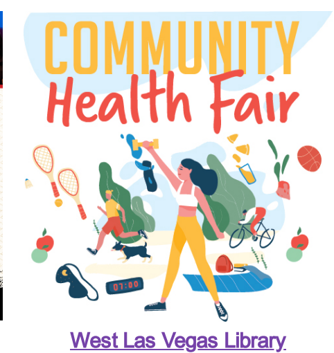
Saturday, May 21 10 a.m. – 3 p.m.