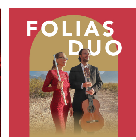
Multiple Locations May 13-15