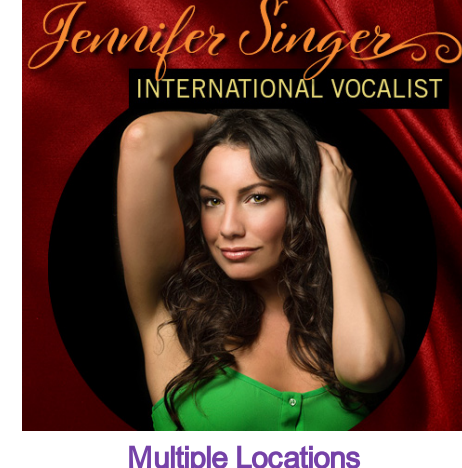
Multiple Locations May 13-14 7:30 p.m. – 8:30 p.m.

Seating in our venues is on a first-come, first-served basis and may be limited. Please visit our website for the most updated program information.