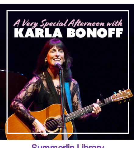
Summerlin Library Sunday, May 15 3 p.m. – 4:30 p.m.