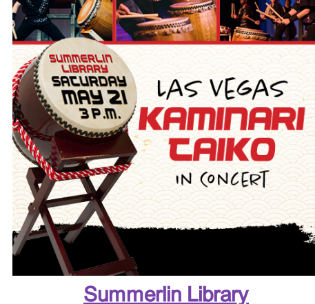
Sunday, May 21 3 p.m. – 4:15 p.m.