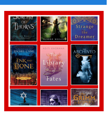
<u>Library Love –</u> Teen Edition