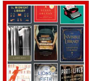
Books About Libraries & Librarians