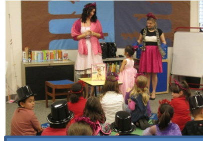
Fancy Nancy Party!!