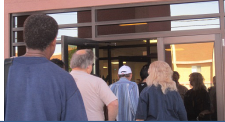
Typical morning rush for computers...