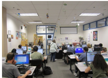
A Tuesday afternoon in the lab...

We like to think of the patrons that use our library as the definition of who we are. Spring Valley's service area has a population of 73,712, with 36,650, or 50%, of those card holders. Geographically speaking, our service area stretches from I-15 on the east up to Durango drive in the west, and from Pennwood to Tropicana on the south side of our area. Spring Valley has averaged 81,500 items per month in circulation this fiscal year, putting us at number three in Circulation in the District for the past 5 months. Of that monthly average, over 50% of our circulation is adult and juvenile DVDs, which are in huge demand in our community due to economic hardships. We provide many essential services to our patrons. Let us introduce you to some of these members of our ethnically and culturally diverse community: