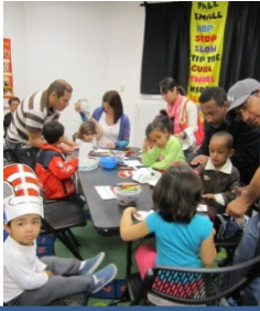
Happy Birthday Dr. Seuss!