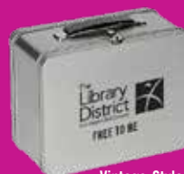
Vintage-Style Metal Lunchbox

One log per person, rewards available while supplies last. Library District employees are not eligible to earn rewards.